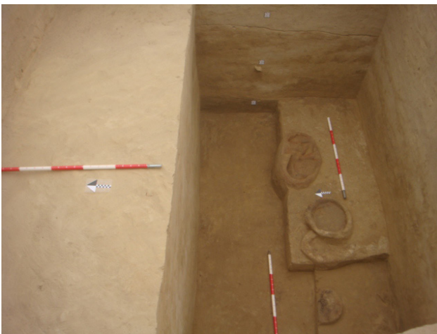
Trench, Mani Mandap