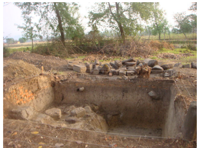
Trench of Dhangadhi

Mani Mandap is very famous religious site of Janakpur municipality, ward no. 13, Dhanusha District where it is believed that the marriage ceremony of legendary Ram and Sita was occurred. It is in south of Pidari Chowk, about half an hour walk only to reach Rani Bazar where Mani Mandap can be located. There is a pond Mani Mandap beside Mani Mandap called Sita Pokhari (pond) where Ram, Laxaman, Bharat and Shatrughan washed their feet. Mani Mandap is spread over 140*111 meters. There is a temple of Ram and Sita in the center. Old Pittojiya Tree on the south of the temple is also very attractive.