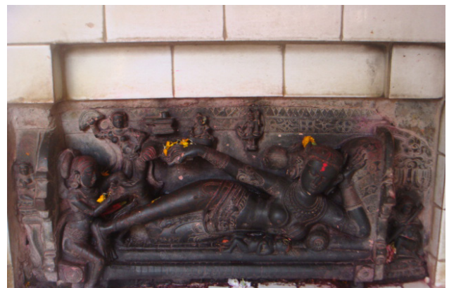
Saddhyojata of Ram Temple, Janakpur

Parvati is holding Kumar by her left arm. She has four hands and in a posture of Lalita Asana. Kumar is sitting at her left lap. It was dug in the middle of 2017, is now in open under a tree inside the police station of Simarongarh. A beautiful decorative pillar was unearthed from Palatiya Mai which has been the original temple of Taleju goddess Bhawani. Likewise, a sculpture of Visnu broken into many pieces has been kept in a public house. It can be conserved by chemist conservator. A fragment of stone inscription and a pillar was also discovered when digging a field. The pillar is without any motif, but the inscription came to be known Vishnu of Janakapur as part of previously found inscription of king Ram Singh Dev.