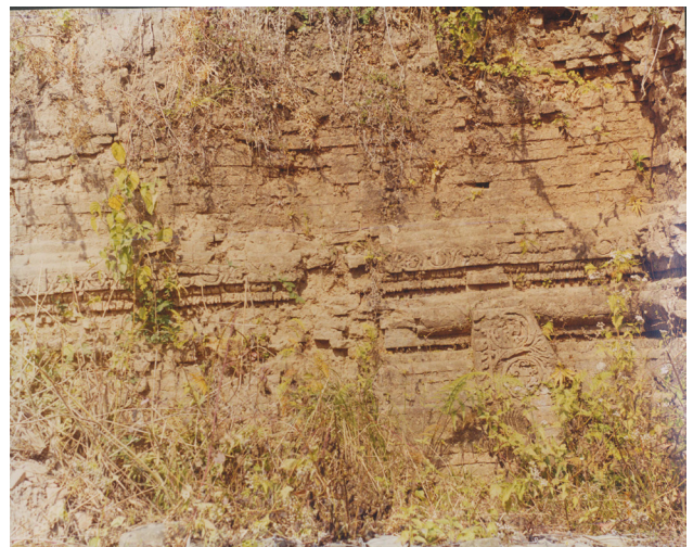
Exposed wall by rain

Chandrabhaga Bhagawati is located 2 km away from Khoksar site on the north west of Chure. It is believed to be tutelary deity established by the king named Chandraketu in 15th century. Saphalya Amatya has mentioned about Kancha Khoriya (Gadhi) and Chandrabhaga ruins. He had emphasised to excavate the ruins because he assumed it as fort, palace and temple (Amatya, 1979, p.15).