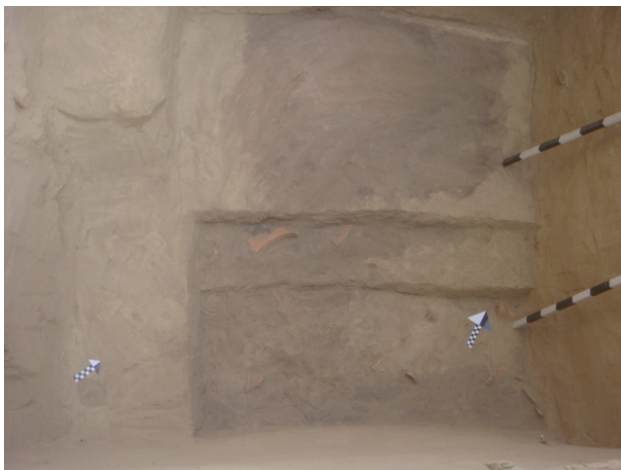
Trench, Mani Mandap

Cultural sequence or chronology could not be observed from Mani Mandap, only cultural patch had been noticed for short period. But potholes show their settlement was wattle and daub. Bricks structure could not be found.