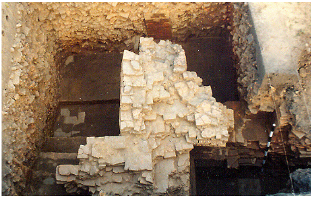
Trench of G5