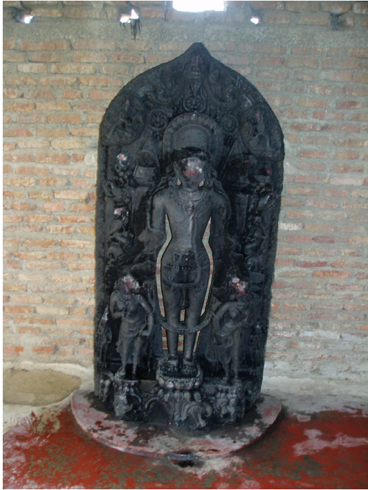
Vishnu, Kusmar, Saswor VDC Saptari district has been known as the famous religious