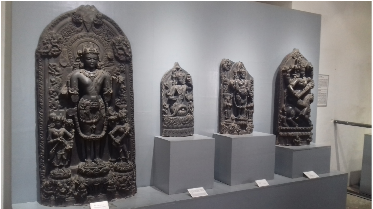
Sculpture from National Museum, Chhauni

There are still a lot of archaeological remains in Simarongarh, though most of the sites have already been destroyed, even though recent finding of artifacts like sculpture of Parvati, artistic stone architectural pillar, broken sculpture of Visnu and Fragment of stone inscription are evidences enough to study it seriously. As many scholars have praised the artistic and beautiful sculptures found from Simarongarh, are said to be influenced by art style of Pala Sena. These are made of black schist stone and mostly in life sized. Such sculptures are found from Valmiki Asram, Simarongarh, Murtiya, Janakpur, Saptari, Varaha Chhetra and Inarua. Few sculptures like Visnu, Nagraj, Singhavahini Durga and Brahma were brought from Simarongarh and kept in National Museum, Chhauni, with care and maintain. But the sculptures in Simarongarh are in such a pity and neglected condition. Don't they deserve to be treated equally like National Museum, Chhauni though they originated from the same place and period ?