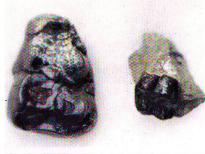
Preserved Teeth