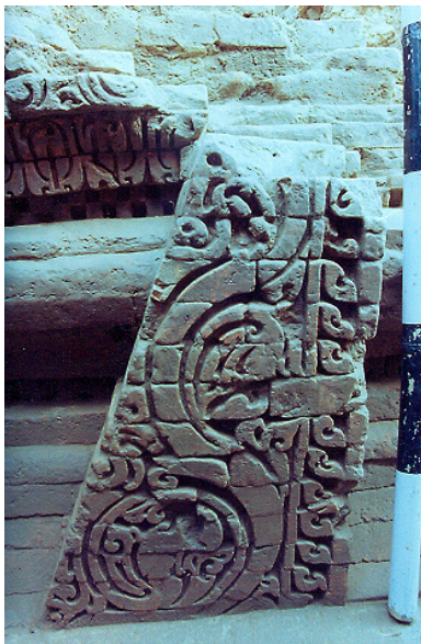
Trench of G6