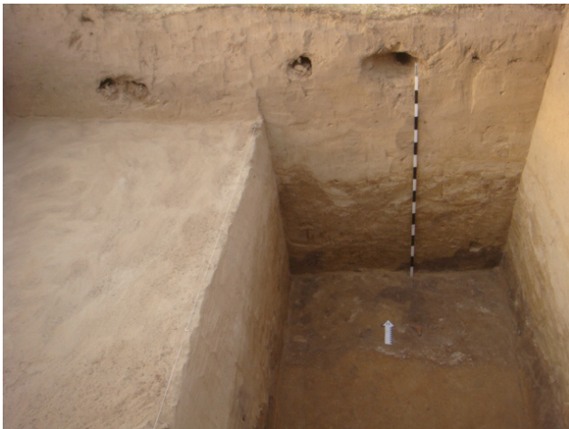
Trench of Vidhyapati Garh