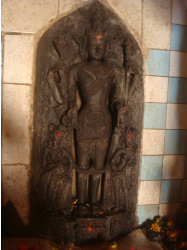
Vishnu of Janakapur

described as Labyrinth fort, but not only that the area is also a prehistoric site. Therefore, Simarongarh is very potential archaeological site for exploration, investigation and excavation.