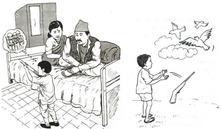
(Picture-1, ‘the warrior and the peaceful’, Nepali language , grade-10, pp.67, 68)

presents an ideal picture of the middle ages of the East.” 5 Today, such types of anthropological tradition have been strengthened by a strategic and selective revival of Buddhist and Hindu legacy and find an important place in the school textbooks.