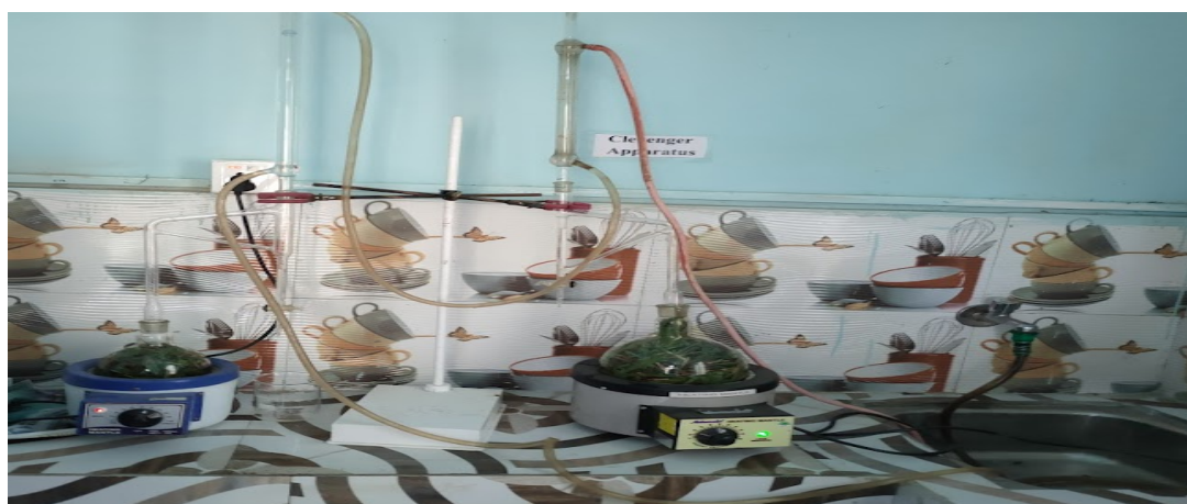
Figure 1: Clevenger Apparatus setup for the extraction of lemongrass oil.

To assess the antibacterial activity, five wells were formed in a petri dish containing S. aureus bacteria. The four wells were designated for Cymbopogon nardus oil at different concentrations, including 100%, 75%, 50%, and 25% and remaining one well was designated Cloxacillin (antibiotic medicine) as a positive control. The petri dishes were then placed in an incubator set at and incubated for 24 hours, ensuring no contamination occurred during this period. After incubation, the diameter of the zones of inhibition around each well was measured using a scale in millimetres. This measurement represents the extent of bacterial growth inhibition and is referred to as the “zone of inhibition” [13–15].