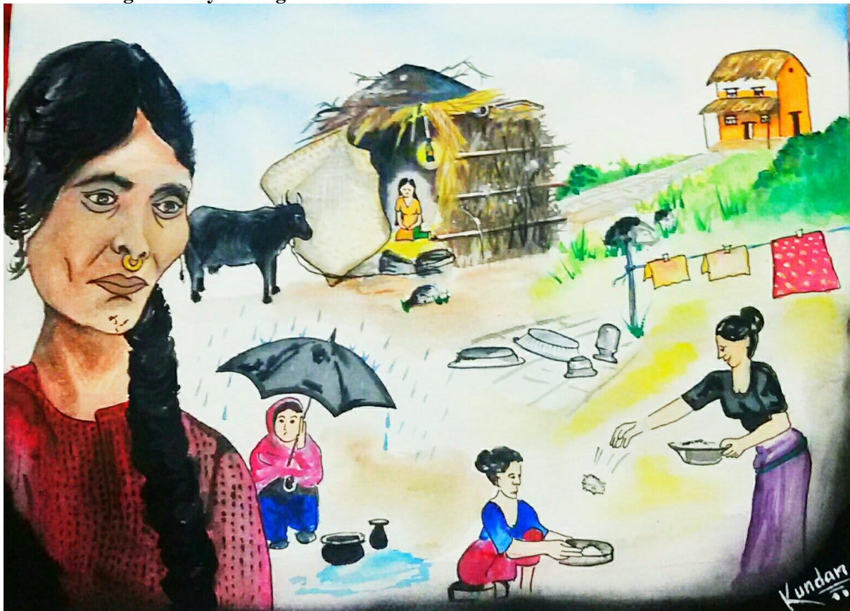
Fig. 3: Illustration showing Chaupadi System in Mid-western Nepal.