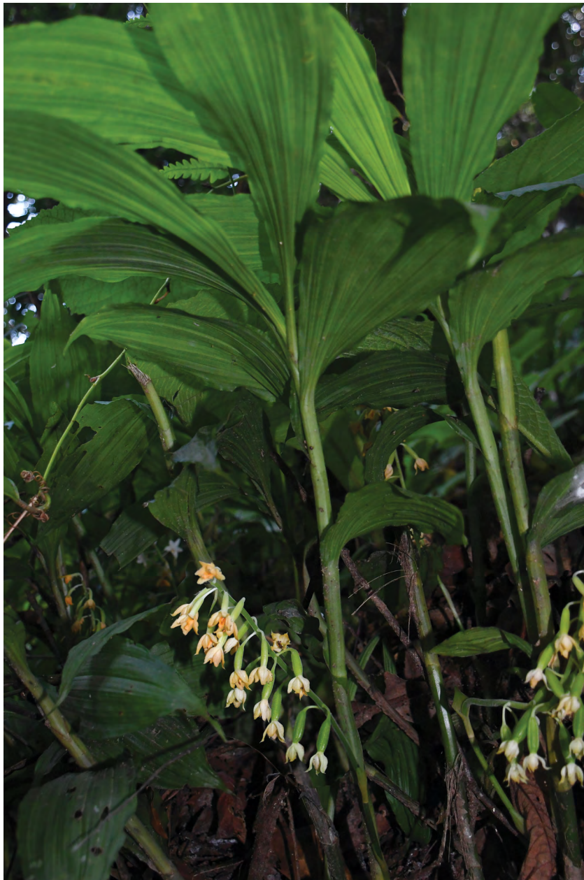
Figure 1: Habit of Calanthe longipes.

Plants: 35–60 cm; Rhizomes: creeping; Stem: usually erect, cylindrical, 6–8 mm in diameter, striate when dry, with distinct nodes and internodes with leafy sheaths at base; Leaves: amplexicaul, elliptic to ovate-oblong, 10–26 cm × 2.5–6 cm, apex narrowly acute to acuminate, margins entire, both surfaces glabrous; Inflorescence: usually one, 10–20 cm, erect when anthesis, ascending after flower maturation; puberulent; lax to dense, 9–17 flowered; Floral bracts: caducous, lanceolate; Flowers: connivent in an inclined or horizontal manner, not completely opened; Sepals: spreading, lance-ovate to lanceolate, 6–8 mm × 2.5–3.5 mm, white, light yellowish-brown when mature, puberulent, apex shortly acuminate; Petals: lance-ovate to ovate, 5–6 mm × 2–3 mm, similar to sepals in colour; Lip: connivent, 4.5–5.5 mm × 3.5–4.5 mm including lateral lobes, oblong-ovate, 3-lobed, white with yellow-orange tinge at center; Lateral lobes: 1.5–1.8 mm,