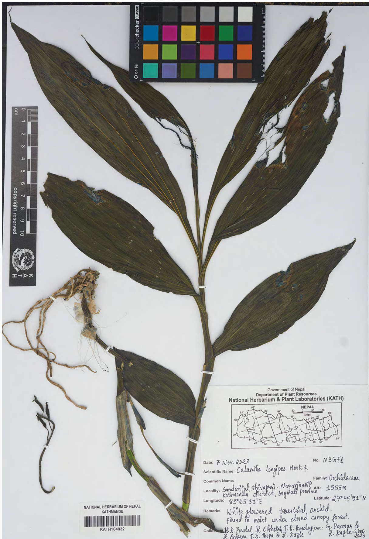
Figure 2: Voucher specimen of C. longipes deposited at the KATH.