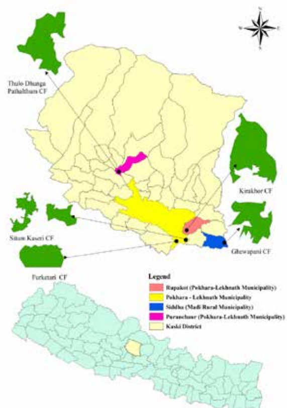
Fig. 1: Map showing study area

The study was carried out in five CFUGs in Kaski District which lies in the middle mountain region of Nepal (Fig. 1). A total of 501 community forest areas have been transferred to local communities, which are managed by 46,390 households (HHs) in the district (DoF, 2018). Out of the total forest user committee members, 37% are women and five CFUGs are led by them. The data was collected during December 2015 to February 2016. The consultation was made with the staff of District Forest Office before selecting the study area. The selected five CFUGs (Table 1) were from almost all parts of the district. Other criteria for selection of CFUGs included representation of mixed castes, at least five years of CF establishment and the good size of the annual income (more than one million).