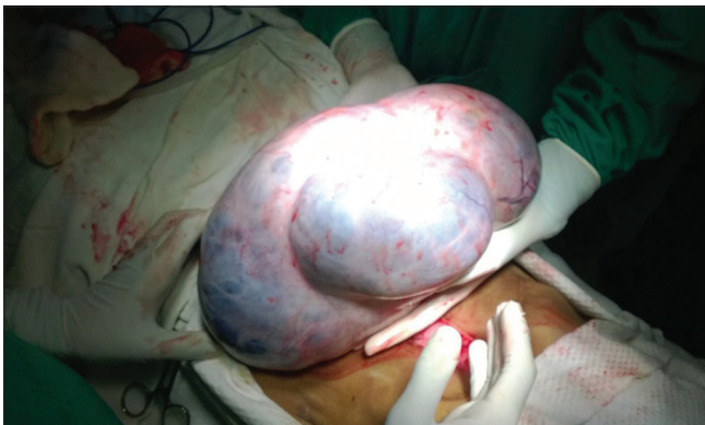
Figure 2: Ovarian tumor during surgery