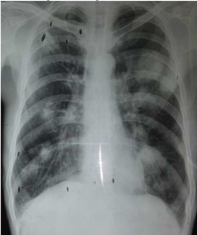
Pic 1. Chest X-Ray PA view

Chest X-ray revealed multiple nodular opacity of varying sizes involving both the lung fields.