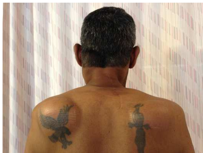
Fig 1. Bilateral symmetrical swellings at posterior of neck and scapular regions.

A 54 year old Indian man presented with 7-year history of bilateral, symmetrical, soft and slow growing swellings at the posterior of neck, upper back and hips (Figure 1). The patient became to have pain which disturbing his sleep for about two months due to gradual growth of the masses. The patient had a history of pulmonary tuberculosis with bronchiectasis and mycetoma in 2001 and heavy alcohol consumption for 30 years and was a smoker. Clinical examination revealed bilateral swelling at the posterior of neck, shoulders and hips regions. The masses were freely mobile and non-tender. There sizes were varied and maximum circumference of about 10 cm. There were no palpable lymph nodes. The blood investigations showed Aspartate Aminotransferase 46 U per litre, Alanine Aminotransferase 16 U per litre, albumin 26 g per litre, Triglycerides 2.23 mmol per litre. The magnetic resonance imaging of neck revealed multiple bilateral symmetrical intermuscular lipomatosis in the neck (Figure 2). A clinical diagnosis of Madelung's disease was made. Abstinence from alcohol was recommended for our patient. General surgeon opinion was sought in view of pain which gave him psychological stress.