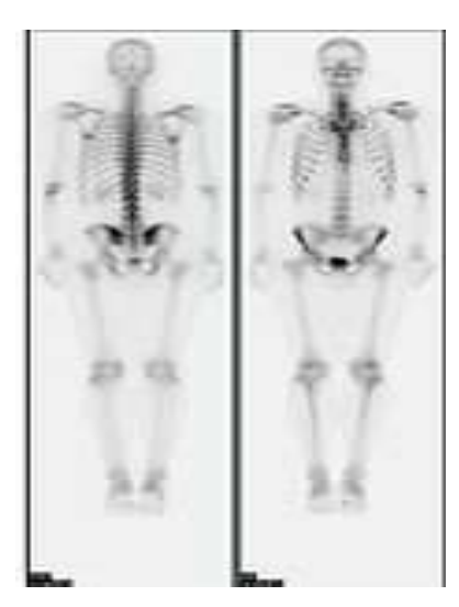
Fig:1 99m Technetium-MDP normal Bone scan

A 73 years male, diagnosed as carcinoma prostate in the year 2002 had undergone bilateral orchidectomy and received Bicalutamide for 2 years. The hormone therapy was stopped after the Serum PSA levels were normal. He was on regular follow up till December 2009 when he presented with complaint of burning micturition. Clinical examination revealed enlarged and hard prostate, rectal mucosa free. Chest X ray and Ultrasound upper Abdomen was normal and MRI pelvis reported enlarged prostate with infiltration into the right seminal vesicle and right posterior urinary bladder wall. Bone scan was normal (Fig:1) and serum PSA was 55.7ng/ml.