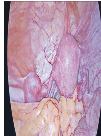
Figure 1: Hydrosalpinx

The study was done to ascertain the clinical profile of infertility patients undergoing HSG. The study was done from June to October 2023. Our study was a cross-sectional hospital-based study. A total of 63 infertile patients were evaluated. The majority of patients were from the age group of 26 to 35 years in our study which was done by study. 8 Our study documented a little higher