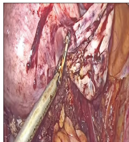
Figure 3: Endometriosis

percentage of primary infertility than the study done by Khan et al. 9 The likely reason could be influenced by different characteristics of the study population and the definition of abnormalities. The majority of patients had a duration of infertility between 2 and 5 years which