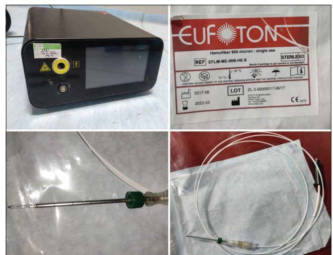
Figure 1: Laser MAR 1500 (Eufoton) components as a type of diode laser of 1470 nm with Eufoton 600 µm hemofiber

The data were collected and entered in a Microsoft Excel sheet, and later, the excel sheet was transported to SPSS 21.0 and an appropriate statistical test, Chi-square and unpaired t-tests are applied.