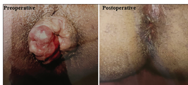
Figure 3: Patient before and after laser treatment