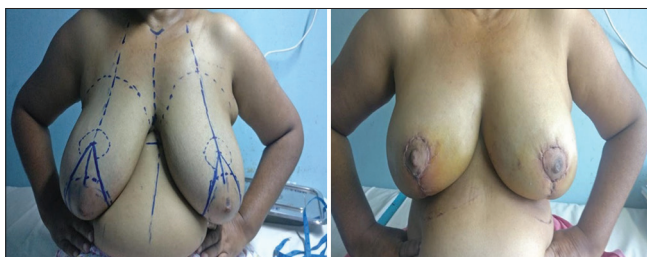
Figure 2: Le jour vertical reduction mammoplasty: on left, pre-operative and on right, post-operative day 7