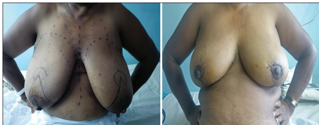
Figure 1: Wise pattern reduction mammoplasty: on left, pre-operative and on right, post-operative day 7

treatable condition and also the inherent cultural restraints of discussing breast-related symptoms. This in addition highlights the importance of considering symptomatic macromastia in the differential diagnosis of patients presenting with chronic neck and back pain, especially in a background where the females would be reluctant to come out with breast-related symptoms.