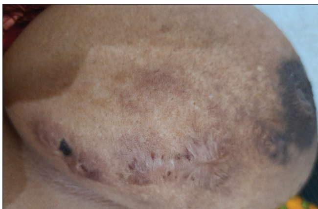
Figure 3: After treatment of idiopathic granulomatous mastitis

showed resolving abscess with sinuses. Pus culture ruled out tuberculosis. Tru-cut biopsy confirmed diagnosis of IGM. She advised broad-spectrum oral antibiotics, analgesic, regular dressing, and other supportive measures. The patient was explained regarding the disease process.