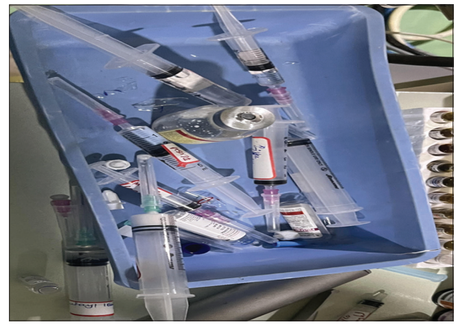
Figure 2: Cluttered drug tray at the end of the procedure in one of the trays

Human error is the most common cause of anesthesia medication error that can cause significant mortality and morbidity to the patient.<sup>10</sup> Injectable medications are identified, drawn up in syringes, labeled, organized, and administered by the anesthesia provider just before administration. As a result, anesthesiologists experience a higher incidence of drug error than any other specialties. In this study, 66.7% of anesthesiologists experienced drug error or "near miss" at some point of time in their anesthesia practice. This is consistent with a study conducted in Turkey which determined that 52.9% of anesthesia workers including anesthesiologists and