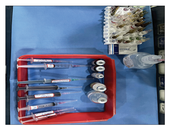
Figure 1: Arrangement of drug tray

The questionnaire consisted of 20 questions with a mix of open-ended and closed-ended questions. Questions were directed towards demographics, knowledge of medication error, and error reporting practice. In the open-ended questions, anesthesiologists were asked to indicate whether a drug administration error or near-miss had occurred. If so, further details were asked to be provided. Table 1 provides the questionnaire used for this study. Collected data were entered in excel software and analyzed using R software version 4.0.1. Continuous data were presented as median and range. Categorical data were presented as count and percent. The Chi-square test was used for categorical variables. Mann–Whitney U-test was used to compare the median of the two groups. P<0.05 were considered statistically significant.