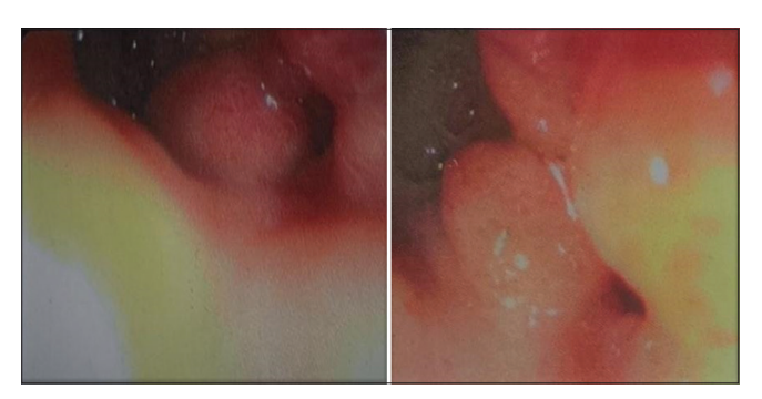
Figure 1: Endoscopic view of the dodenal mass being biopsied

On microscopy, duodenum was lined by a hyperplastic columnar epithelium, lamina propria and submucosa showed a sheet of brunner's gland, and lobules of gland were separated by septae of proliferative smooth muscles. Some of nests of brunner's gland were cystically dilated with scant mitotic activity and extended up to the base of the duodenal villi admixed with chronic inflammatory infiltrate. The overall growth pattern of the gland was expansile rather than infiltrative due to which overlying mucosal epithelium was appear to be effaced and showed decreased number of crypts and villi; pancreas was appear to be pushed outwards. No infiltration was noted in circumferential margins or adjacent structures.