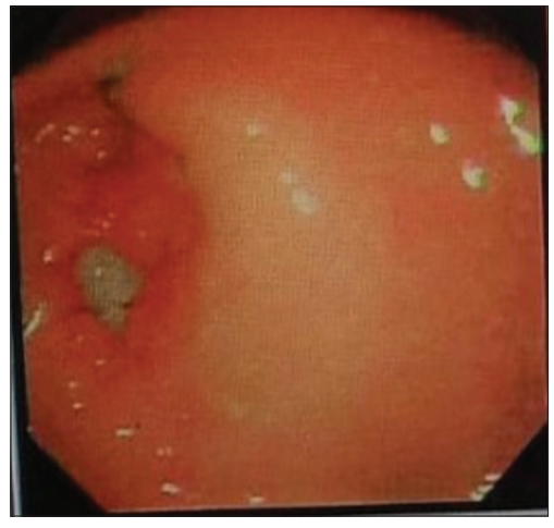
Figure 2: Endoscopic view of chronic deep ulcers in indurated margins