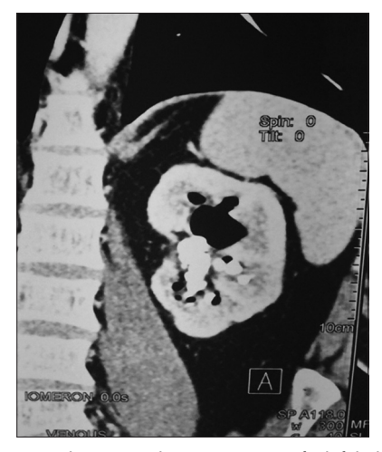
Figure 1: Computed tomography scan picture of a left kidney showing stone in renal pelvis and gas in the pelvicalyceal system extending into the parenchyma