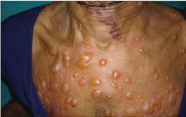
Image 4: Lesion in Bullous pemphigoid – Large tense bulla can be noted on the chest areas

range for BP was between 34 to 81 years with mean age of presentation being 57.72 years in contrast to previous study mean age of presentation ranges from 60 to 75 years. 5 Majority of our patients presented at 5 th decade or later.