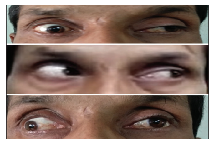
Figure 1: Images taken in primary gaze, left and right gaze showing evidence of ophthalmoplegia with left eye ptosis and right eyelid retraction

Unilateral ptosis and contralateral eyelid retraction originally described as palpebral plus-minus syndrome by Gaymard et al.1