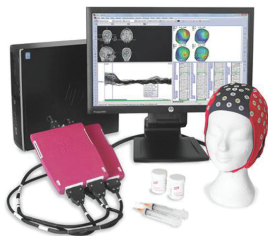
Figure 1: Electroencephalographic device, eego™mylab

Based on Table 1 and Figure 2, it was found that delta and theta brainwaves increased with statistically significant at the 0.05 level while alpha, beta, and gamma bands did not change. Delta brainwave increased after listening to Ohm chanting with statistically significant at the 0.05 level (before listening to Ohm chanting: 0.63 \pm 0.16 \mu V ; after listening to Ohm chanting: 1.49 \pm 0.49 ; p = 0.01 ). Similar to delta brainwave, theta brainwave also increased after listening to Ohm chanting with statistically significant at the 0.05 level (before listening to Ohm chanting: 0.08 \pm 0.21 \mu V ; after listening to Ohm chanting: 1.45 \pm 0.73 ; p = 0.01 ). Moreover, it was found that alpha brainwave increased after listening to Ohm chanting with no statistically significant (before