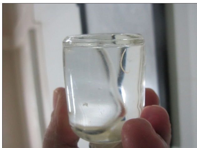
Figure 4: Retrieved worm in bottle containing normal saline

normal saline and sent for microbiological examination at Microbiology department of Universal College of Medical Sciences, Bhairahawa (Figure 4). The worm was confirmed to be Enterobius vermicularis .