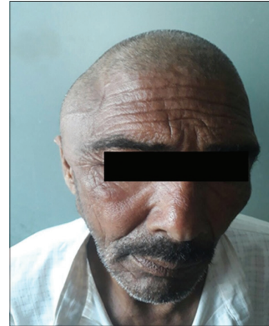
Figure 1: Photograph of the patient showing diffuse swelling of the right temporoparietal region