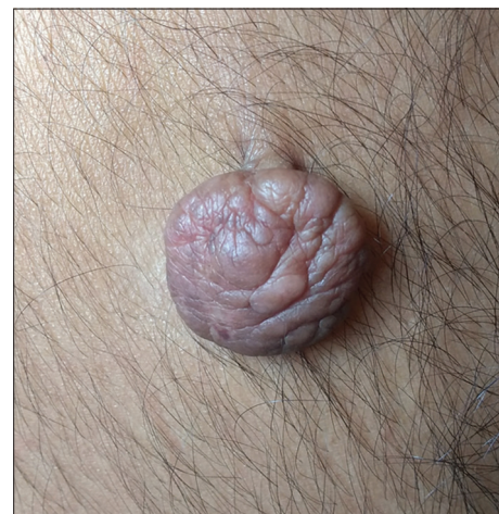
Figure 2: Skin tag over the right side of the back