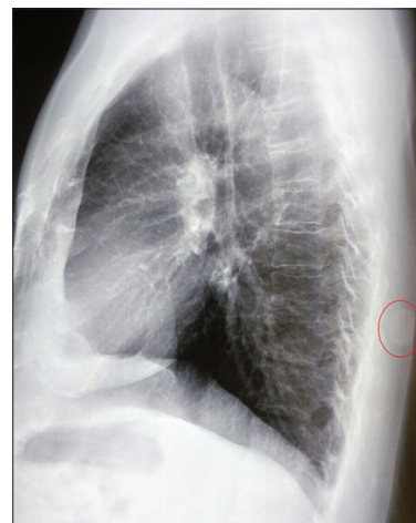
Figure 3: Chest Xray (lateral view) showing the skin tag