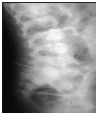
Figure 3: X ray of the lumbosacral spine showing a long slender foreign body at level of L5-S1