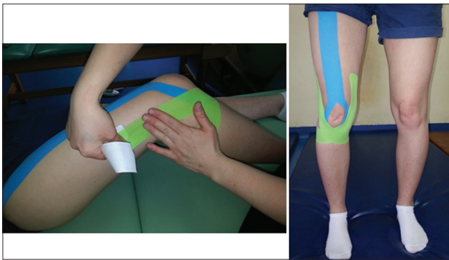
Figure 1: Application KT for quadriceps femoris with supporting proprioception

Basic statistic tools were used – the arithmetic means with standard deviations. Differences between the results of each measurement were counted by means of Wilcoxon signed-rank test. The U Mann-Whitney test was used for the estimation of differences between the groups. The minimum significance level was fixed on level p \leq 0.05 . Data was analyzed using Statistica version 10.0.