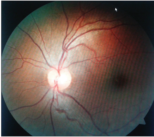
Figure 1: Fundus picture of left eye