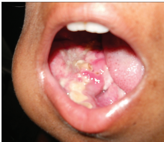
Figure 3: A reddish white nodular growth noted obscuring the crowns of the tooth around the vicinity of the lesion