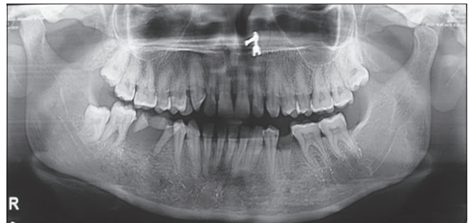
Figure 4: OPG reveals root stumps with evidence of vertical bone loss on the mesial aspect of 47. Radiolucency is also noted at the anterior apical region of the mandible

OPG reveals a diffuse radiolucent lesion associated with the root stumps of 46 and resorption of the alveolar bone. Lymph nodes in the affected area could not be palpated as there was inferior extension of the lesion. Blood and other investigations including bone marrow biopsy could not be done as following incisional biopsy patient was not available and after few months, we lost the patient. Hemopoetic bone marrow defect is evident in the anterior mandibular region (Figure 4). Histopathological examination of the biopsy specimen revealed monomorphic cells consisting vesicular round to ovoid nuclei and eccentrically placed large prominent nucleoli (Figure 5).