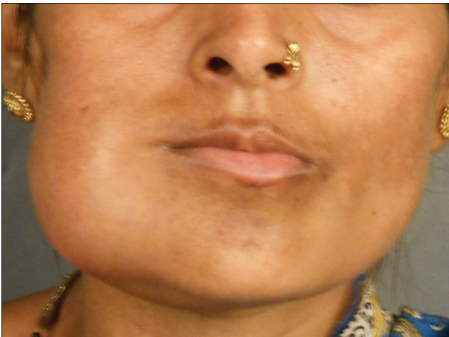
Figure 1: Gross facial asymmetry observed on the right side of the face