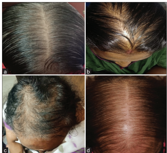
Figure 1: Clinical Images of scalp. (a) Sinclair grade 2 female pattern hair loss (FPHL), (b) Sinclair grade 3 FPHL, (c) Sinclair grade 4 FPHL, (d) Sinclair grade 5 FPHL