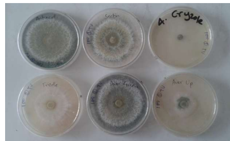
Figure 1b. Growth of Trichoderma isolate Tv in different chemical treated plates

Carbendazim, Benomyl, Hexaconazole even when tested at very low concentrations ( < 100 ppm) have been found to be inhibitory to Trichoderma growth by several authors (Sirohi et al., 2009; Bagwan, 2010; Madhusudhan et