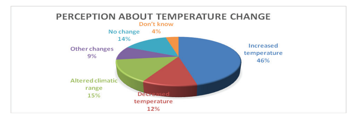
Figure 1 : Farmers' perception about temperature change in Rupandehi district, 2014

Figure 1 and 2 present farmers' perception about temperature change and precipitation in Rupandehi district in 2014. Majority of the respondents (46%) expressed that they perceived the increased temperature in 2014. Majority of the respondents (30%) perceived the decreased rainfall and 33% perceived the change in timing of rains in Rupandehi district (Figure 2).