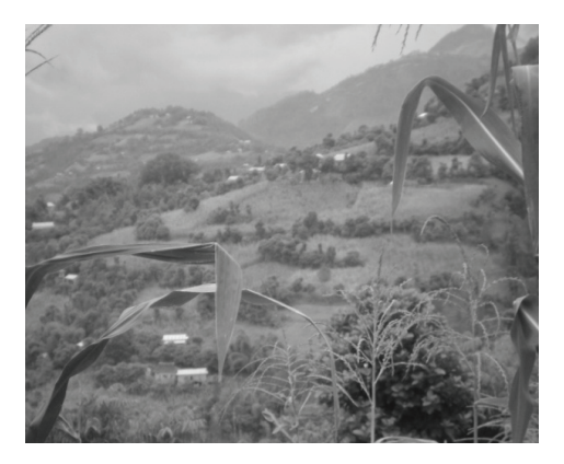
Figure 3. Maize in unterraced ( Pata ) farming system in Wagla-4, Arghakhanchi