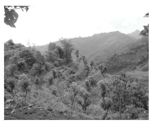
Figure 2. Maize in terraced farming system in Kinhu-4, Tanahun.