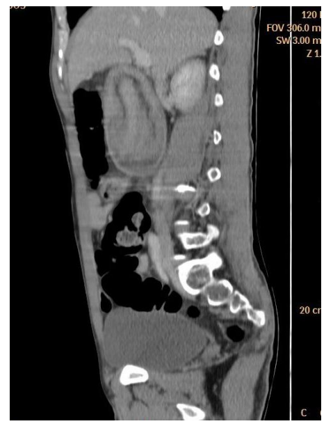
Fig. 5:CT abdomen sagittal reconstruction reveals, bowel within bowel configuration along with mesenteric vessels s/o gastroduodenal intussusception.

A well-defined moderately heterogeneously enhancing 6.7 X 5.2 X 7 cms mass lesion, was present in the region of the second & third part of the duodenum acting as lead point (Fig. 3). Although extremely rare, a diagnosis of intussusception of a GIST was suggested. At laparotomy, third part of the duodenum was distended by a hard mass. Manipulation of the mass delivered it into the stomach and a simple gastrotomy revealed a 5 X 4 cm stromal tumour on a long pedicle derived from the mucosa of the anterior gastric antrum. The base of the tumour was excised and the gastrotomy closed. There was no evidence of metastatic spread. The patient made an uneventful postoperative recovery. Histology confirmed the preoperative diagnosis.