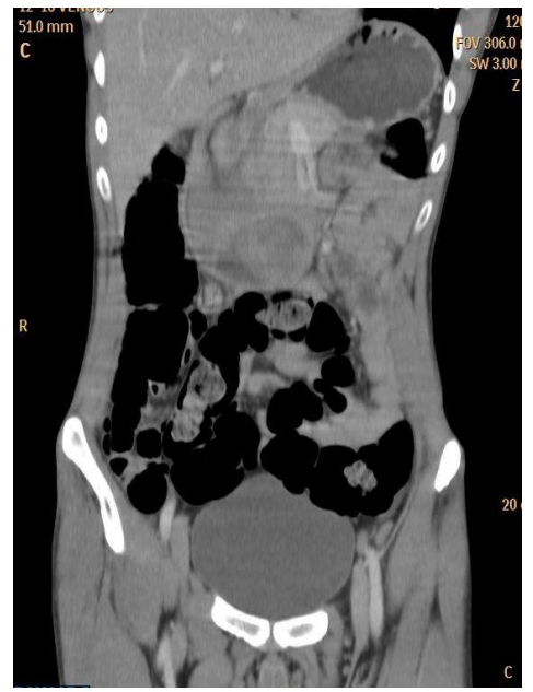
Fig.4:CT abdomen coronal reconstruction reveals, bowel within bowel configuration along with mesenteric vessels s/o gastroduodenal intussusception.

bowel wall at the second & third part of duodenum which is surrounded by rim of low density tissue compatible with fat (Fig. 1, 2, 4 & 5).