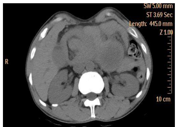
Fig. 1: CT abdomen plain study showing telescoping of antropyloric portion of stomach along with its lesser & greater omentum into first & second part of duodenum giving "CT target sign" with no obvious calcifications.

A 50 years old male presented with history of recurrent episodes of indigestion and recent history of intermittent severe epigastric pain, premature fullness and nonbile stained vomiting and undigested food. Between these episodes the patient was well. On examination, there was mild tenderness in the epigastrium but no mass was palpable. All haematological and biochemical indices were normal.