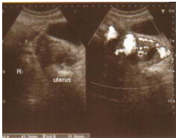
Fig 1. Doppler sonography of a vascular mass in the left adnexa.

Adhesiolysis was done followed by removal of metastatic nodule from POD, uterus, tubes and ovaries on both sides. Surgeon oncologist removed the metastatic nodule from right lobe of liver, the larger one, along with omental biopsy. On cut section, endometrial and cervical canal were empty and the ratio of uterus to cervix was 1:1. The fimbrial end containing tumour mass was rough, nodular with irregular surface and hard in consistency. So the post-operative diagnosis considered was primary carcinoma of fallopian tube, stage IV. Post-operative period was uneventful. She was discharged on 17 th post-operative day and the tension sutures were removed on 30 th day of operation.