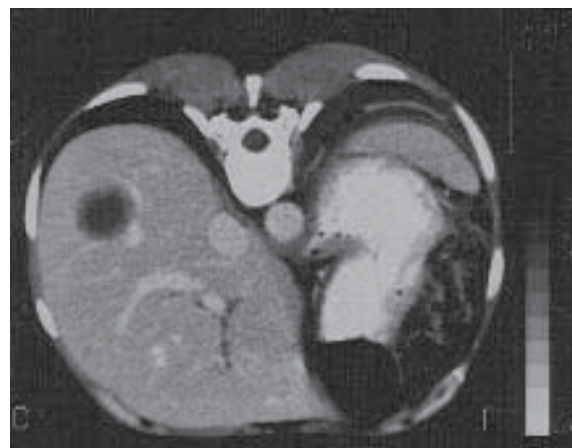
Fig 2. CT scans showing a heterogenous lesion in Rt lobe of liver suggesting metastasis

Duration of symptoms can be variable in fallopian tube carcinoma. It could be from 2 months to as long as 48 months; 50% of patients had symptoms and 6% did not. 2 Our case too had a duration of symptoms for 2 months although they were not specific to fallopian