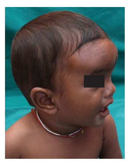
Fig 1: Photograph showing boggy swelling over forehead

Agenesis of skull bones, especially if associated with brain anomalies are incompatible with life. These defects are commonly located over parietal bones and the vertex between anterior and posterior fontanelles. Possible etiologies for skull bone defects are genetic,