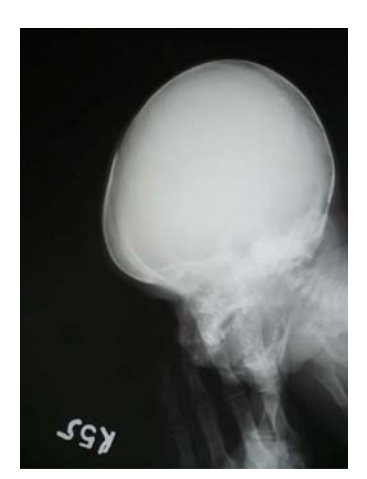
Fig 2: X-ray skull lateral view showing large bony calvarium with small sella.