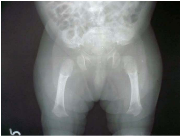
Fig 3: X-ray pelvis anteroposterior view with bilateral lower limb showing bilateral femora and tibiae appear short and wide with increased radiolucency at the upper end of femora. Bilaterally iliac blades appear small and square (Tombstone appearance).