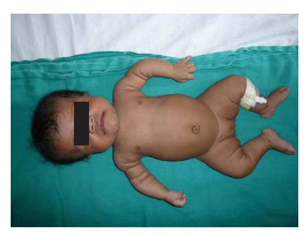
Fig 1: Achondroplastic child with large head and rhizomelic (proximal) shortening of limbs.

The radiologic features of true achondroplasia and much concerning the natural history of the condition were presented by Langer et al (1967)<sup>4</sup> on the basis of a study of 101 cases and by Hall (1988). True megalencephaly occurs in achondroplasia and has been speculated to indicate effects of the gene other than those on the skeleton alone <sup>5</sup> Disproportion between the base of the skull and the brain results in internal hydrocephalus in some cases. In our case there was no hydrocephalus