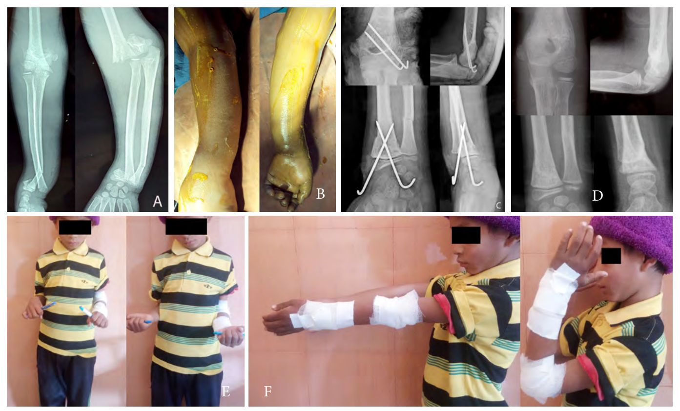
Fig 2: A . Radiographs of a 9-year-old boy with open (Gustilo I) displaced supracondylar fracture and closed distal radius and ulna fracture after a fall from tree. B. The deformed limb; C . After closed reduction, K-wire fixation of the elbow distal radius. D . After removal of K-wires at 8 weeks. E,F . Final excellent outcome according to modified Flynn criteria.