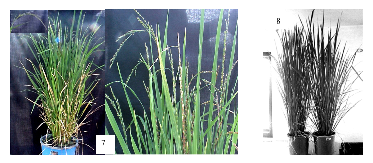
Figures 2. Growing regenerated plant (somaclone) derived from seed calli: 7) regenerated plant from Tilki at milking stage, and 8) showing parent (left) and regenerated plant (right) at flowering stage of Masuli