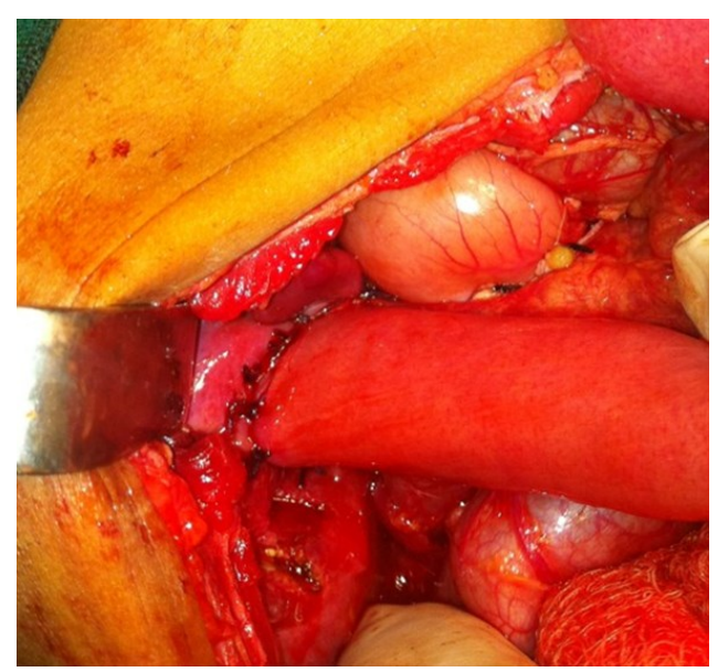
Figure 2: Hepaticojejunostomy after excision of choledochal cyst

According to Kumar and Rajagopalan<sup>15</sup> 15% of the patients may have features of hepatic changes of cirrhosis, pancreatitis or choledocholithiasis while in the present study none of the patients presented with cirrhosis, pancreatitis or choledocholithiasis. Ultrasonography (USG) is usually the first examination and is a very sensitive (71 to 97%) in the detection of choledochal cyst.<sup>9, 18</sup> A properly performed high resolution USG is the best screening test.<sup>20</sup> Le et al<sup>21</sup> described 38 cases of choledochal cyst where in all cases USG was the only diagnostic modality. Similarly, in our study