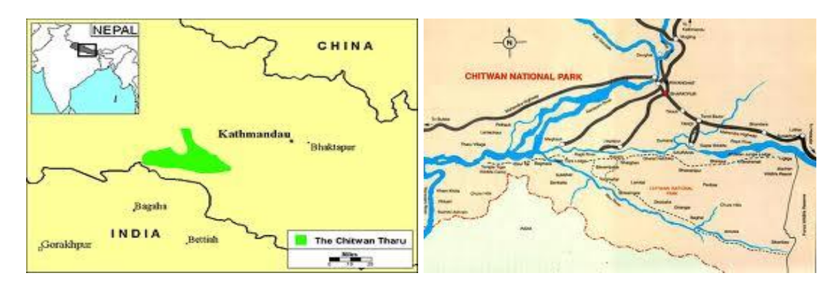
Fig. 1. Chitwan National Park and its Boundary

The park has 503 endangered great one-horned Asian rhinoceros, 120 Royal Bengal tigers and 40-50 elephants. Other threatened mammals found in the park include leopard, wild dog, sloth bear and gaur. Mammals such as sambar, chital, hog deer, barking deer, wild pig, monkeys, otter, porcupine, yellow-throated marten, civet, fishing cat, jungle cat, jackal, striped hyena and Indian fox are also found in this park. Aquatic species include the Gangetic dolphin, the mugger crocodile and the endangered gharial. 545 species of birds and 120 fish species inhabit the park (CNPO, 2013).