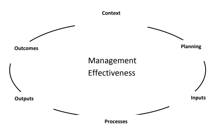
Figure-2: Framework for management effectiveness evaluation

Management effectiveness evaluation was carried out for Chitwan National Park in 2003 and 2007 by UNESCO/IUCN project: Enhancing Our Heritage- Managing and Monitoring for Success in Natural World Heritage Sites. The status of management plan implementation status in 2007 is given below.