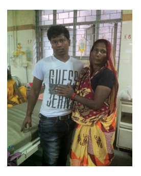
Fig. 3 and 4: Clinical photography