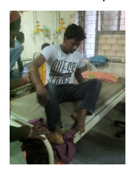
Fig. 5: Clinical photography

Management was started with intravenous fluids, Intravenous vitamin B complex and Pantoprazole 40 mg i.v. in the emergency