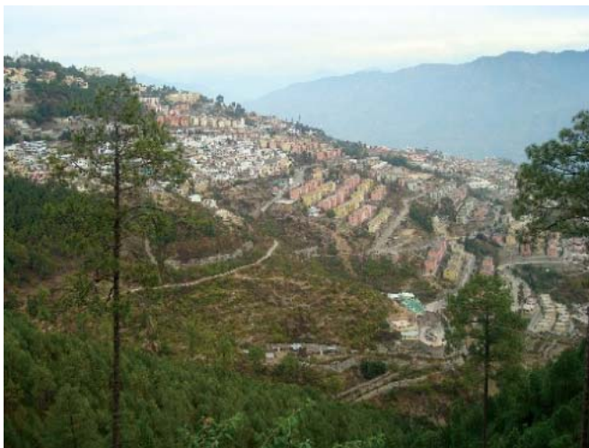
Photo 2. New Tehri Town

One of the major issues of Tehri Dam implementation has been its safety aspect against seismic concerns in the Himalayan region. As the Main Central Thrust and Main Boundary Thrust lines traverse along the entire Himalayan region, the area is susceptible to high seismic risk. Over the past century several earthquake events have occurred in the region. Four of which were over eight on Richter Scale. During the design of the Tehri Project, a detailed