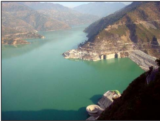
Photo 1. Tehri Reservoir and Dam

during off peak hours and generate 1,000 MW of power during peak hours. The main Tehri Dam is constructed about 40 km upstream of Devprayag, while Koteshwar Dam is situated at 22 km downstream of the main Tehri Dam. Being a multipurpose project, the Tehri Dam Project aims to irrigate 0.874 million hectares of land in Uttar Pradesh and to provide drinking water supply to Delhi and UP in addition to power generation. The geographical locations of these projects are in Mahabharat range (similar to the Budhi Gandaki, West Seti and Arun Valley sites of Nepal).