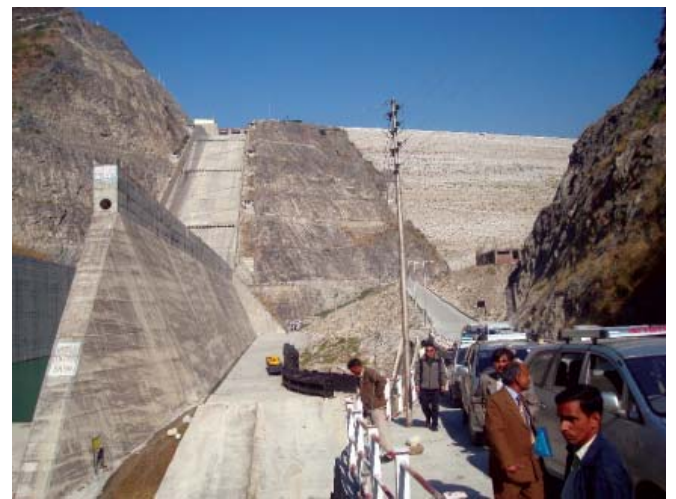
Photo 3. Downstream View of Tehri Dam