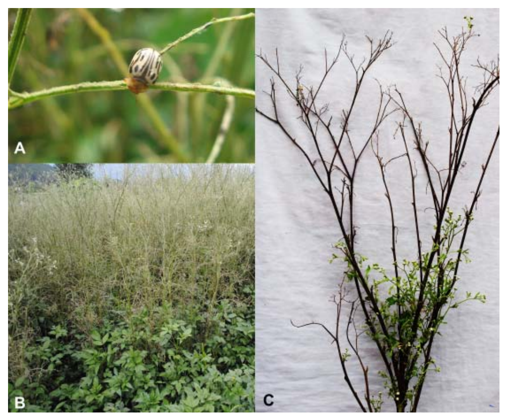
Figure 1. (A) Mature beetle ( Zygogramma bicolorata ), (B) Complete defoliation of Parthenium by the beetle while other species remained unaffected, (C) Re-growth of Parthenium after complete defoliation early in the growing season.