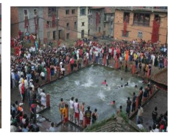
Photo 3: Ritual fortification of different neighbourhoods within the town

In the past, water needed for irrigation had been brought to the settlement through long distance canal 'rajkulos' starting from the foothills (Becker- Ritterspace, 1994), whereas provision of drinking water had been fulfilled by constructing ponds, deep well as reservoirs and depressed pit conduits 'dhunge-dharas.' Combination of different rituals and religious belief had kept water sources pollution free. Individual people considered 'naaga' (serpent) as a source of water and believed that anyone agitating the 'naaga' by polluting the water sources would suffer from skin diseases and infections. In addition to these, use of black clay, compost and human excrement as manure, maintenance of quality soil, seeds and indigenous methods had significantly increased the agricultural products. The by-product of agricultural waste had been used for live stocks and animal husbandry. Cow and buffalo dung were used for alternative source of energy by mixing with the straw and then drying