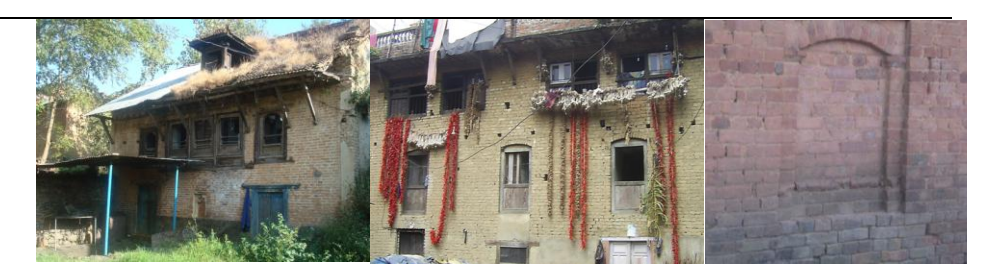
Photo 2: Salient features of traditional architecture in rural context

with seasons and the type of crops produced – provides dynamism in the streetscape (Photo 2). Moreover, there used to keep false window creating illusion for pedestrians. In the building, the top level and the ground floor acting as a buffer zone protects occupants from cold winter night. Warmer upper floors and courtyards are used during daytime. Minimum energy is lost due to heavy composite wall (sun dried and adobe), inside mud plaster, composite mud and wooden flooring.